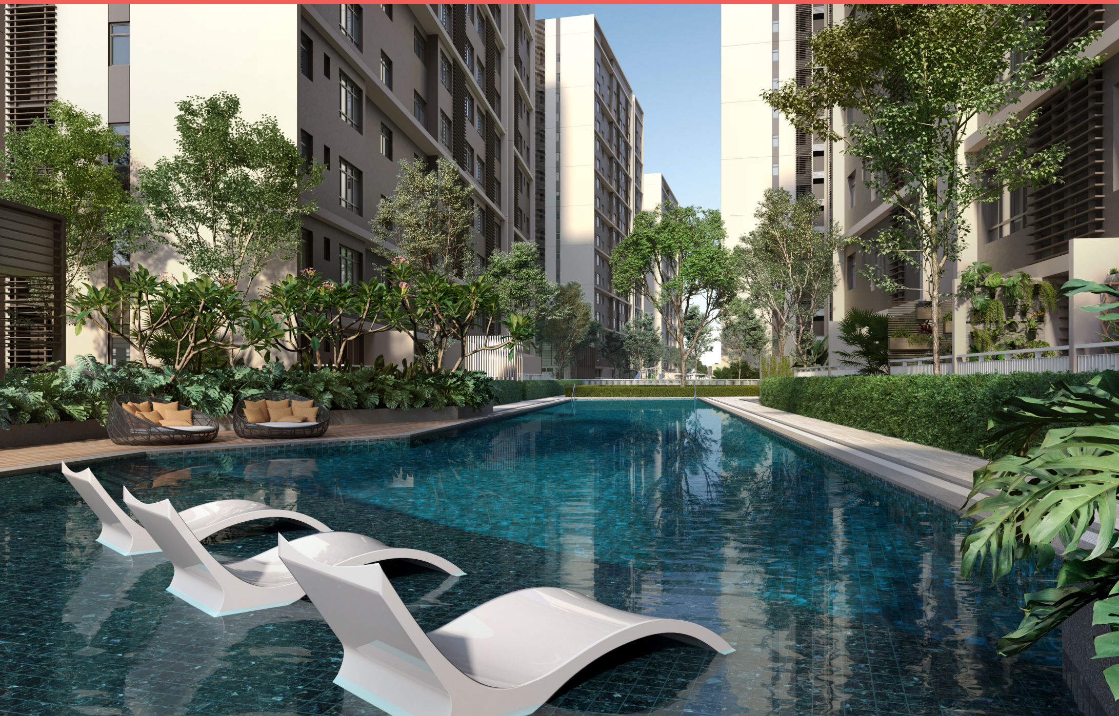
A stylish poolside oasis of chic serenity