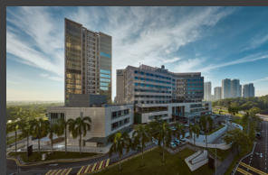
Gleneagles Medini Hospital