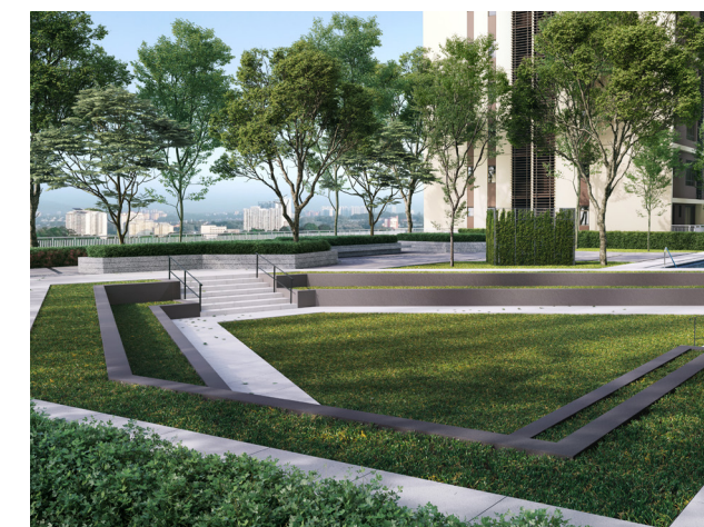
Chill out amidst sizzling savoury aromas

Where joy knows no bounds and laughter dances freely. Embrace simplicity, live joyfully, and cherish every moment.