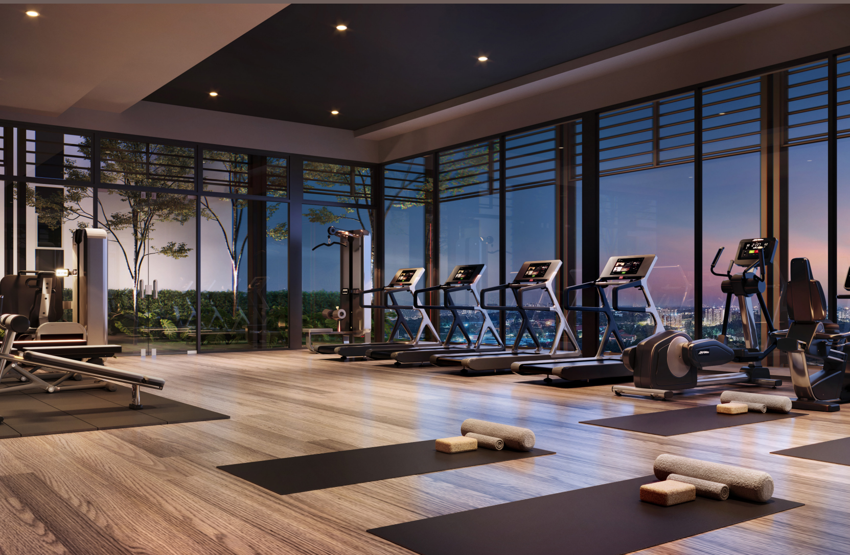
Sculpting bodies, forging minds: where fitness dreams thrive

Step into the challenge zone and chase your fitness goals