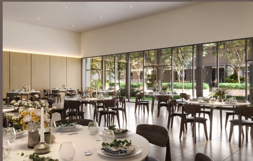
Chic and stylish convenience: space for you to play host

Where challenges are not obstacles but stepping stones, and life is all about the balancing act.