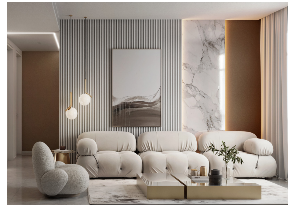
Tranquil spaces for a life of gentle comfort

to level up and unlock the next chapter of your amazing journey.