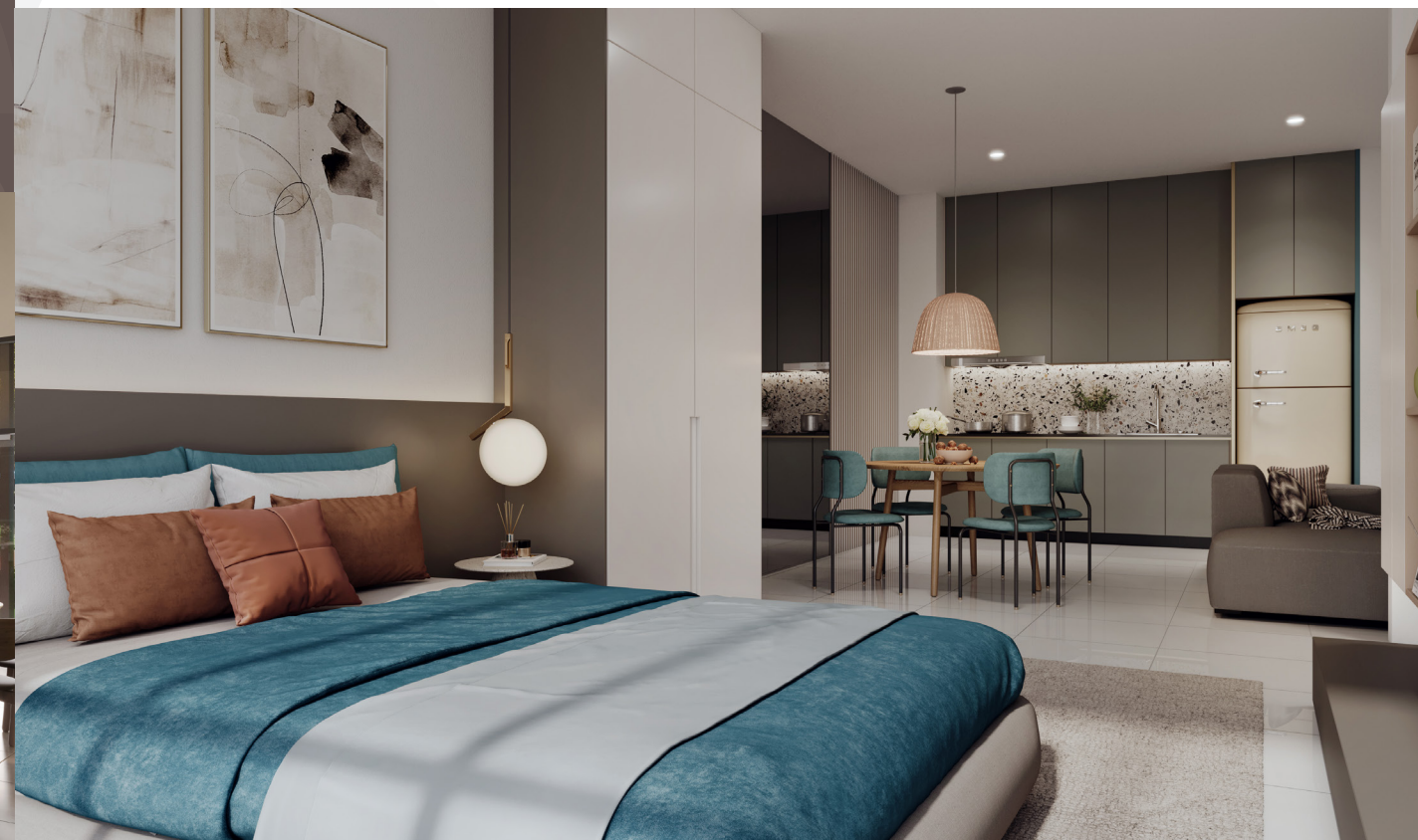
Lavish opulence that defines a life of luxury