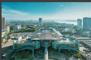
Sultan Iskandar CIQ