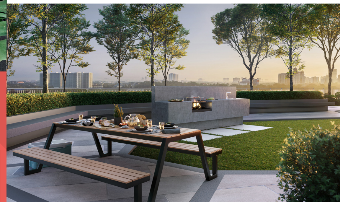
Sunken sanctuary for tranquil gatherings

Cannonball into the sparkling waters or lounge poolside for the best Insta-worthy shots. Sizzle, grill and chill with your squad at the outdoor BBQ and hangout area. Outdoor bliss takes centre stage in the sunken lawn, where good company meets great vibes.